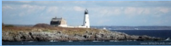
Photograph by Bill Edmunds our Website Tech Support

Friends of Wood Island Lighthouse woodislandlighthouse.org PO Box 26, Biddeford Pool, ME 04006